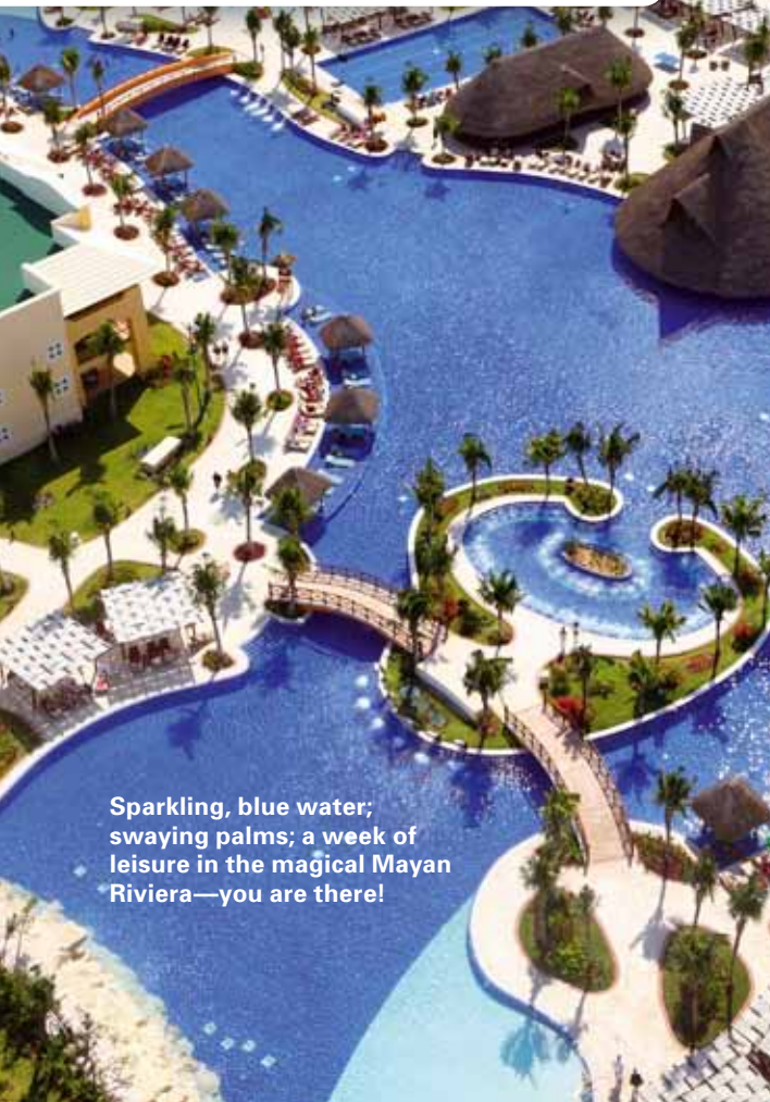
Sparkling, blue water; swaying palms; a week of leisure in the magical Mayan Riviera—you are there!