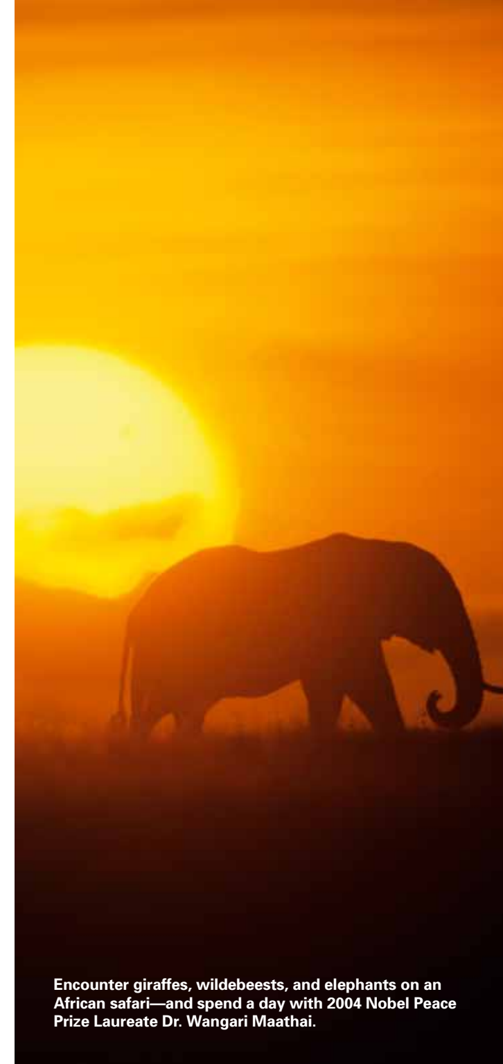
Encounter giraffes, wildebeests, and elephants on an African safari—and spend a day with 2004 Nobel Peace Prize Laureate Dr. Wangari Maathai.

Whatever your dream, we can help you make it a reality.