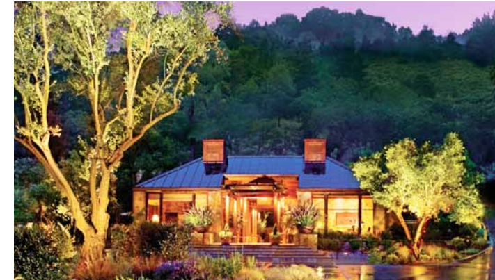
On your way to the top—a luxurious stay at a five-star spa resort in California's lush Napa Valley.