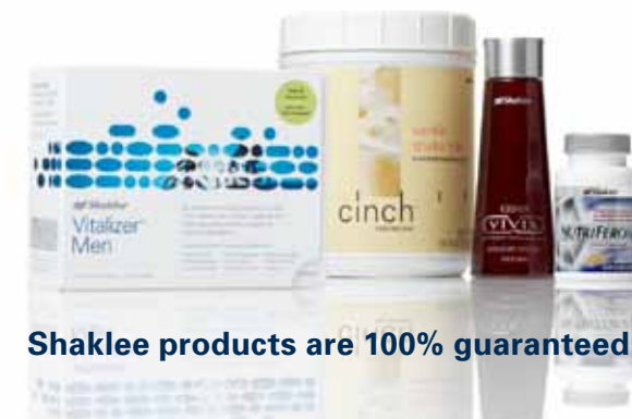
Shalkee products are 100% guaranteed.

Let us show you how, in 15 months, you can drive a new car, earn up to $100,000, qualify for world travel, and start achieving the life of your dreams. All of this by using and sharing products that improve your health and the health of those you love.