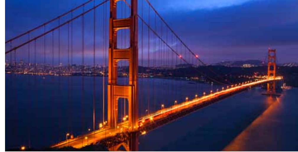
Celebrate your success with a trip to San Francisco and immerse yourself in all its scenic beauty.