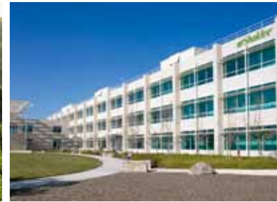
Join us in the San Francisco Bay Area for our New Directors Conference, a personal tour of the Shalkee Global Headquarters, and an elegant evening at a Bay Area vineyard.